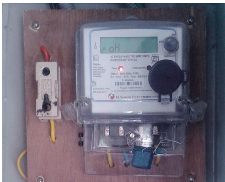
Figure 3 El Sewedy meter deployed for CESC

This was followed up in November 2015 by a purchase order from Enzen for a commercial smart metering implementation for PVVNL in Uttar Pradesh, India. Cyan will provide over 13,000 smart meters and associated hardware and software while the Company's head end software will be provided as a managed service hosted by Cyan and charged on a per meter per year basis, delivering a recurring revenue stream. The order from PVVNL is Cyan's second commercial implementation of AMI technology by a public utility for consumers in India.