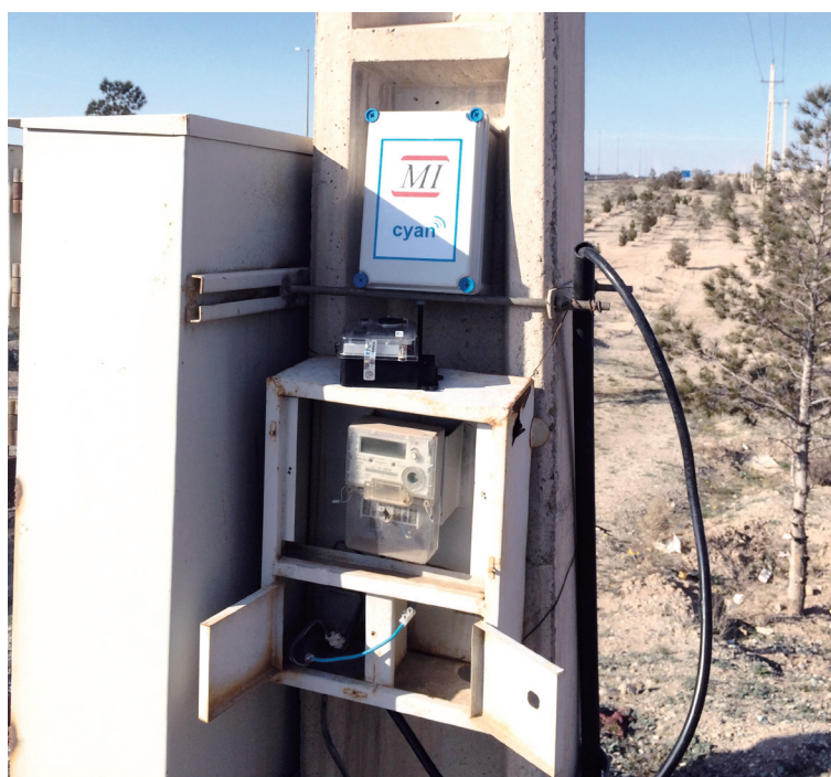
Figure 4 Street traffic camera smart metering deployment, Iran

In February 2016, we announced a purchase order from Micromodje for a street traffic cameras smart metering project in Iran. The order was placed only a couple of weeks after international sanctions were lifted on Iran on 16 January 2016 and is believed to be one of the first orders secured by a UK business, with support from the specialist UK Trade and Investment team. Following the successful pilot of this smart metering project in February and March 2016, Micromodje placed a £10 million order in April for Cyan’s AMI solution for 360,000 electricity meters, with over 50% of the order value being recurring software licenses. This purchase order is significantly larger than any purchase order received to date by Cyan and marks a step change in the Company’s commercial progress. Cyan has started a dialogue with Micromodje on the next planned rollout of 1 million units, leading to the overall Iran market requirement of 33 million smart electricity meters.